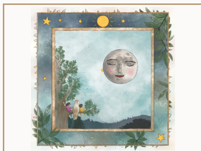
MOON LOST HER EARRING