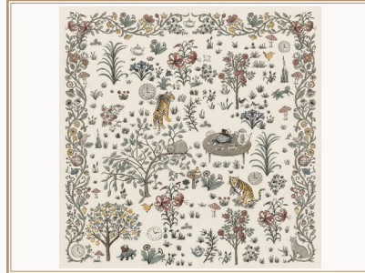
TAZ'S TEA TIME