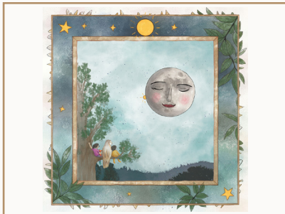
MOON LOST HER EARRING