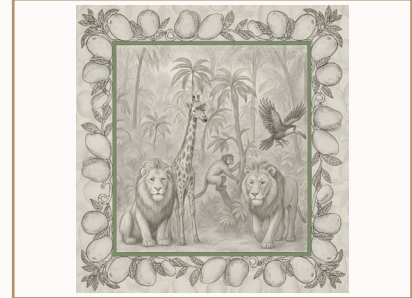
THE GIRAFFE & LION