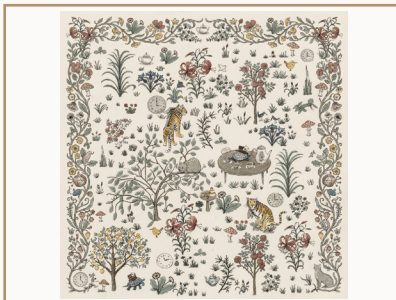
TAZ'S TEA TIME