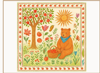
SWEET TOOTHED BEAR