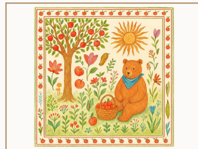
SWEET TOOTHED BEAR